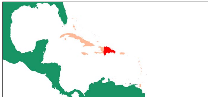
Pic. 2: Dominican Republic in the Caribbean