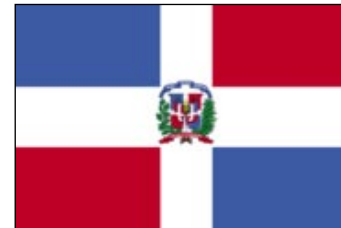
Pic. 3: Flag of the Dominican Republic

The capital of the Dominican Republic is Santo Domingo, which counts about 1 Mio. inhabitants, the suburbs included nearly 3 Mio. people - that is about one third of the whole population. The urban population makes up 67%, which means that there is a high degree of urbanization, and as far as the capital is concerned, the largest amount of trade and fair takes place there. Therefore the Dominican Republic is a typical so called primate urban system according to Saskia Sassen 1 .