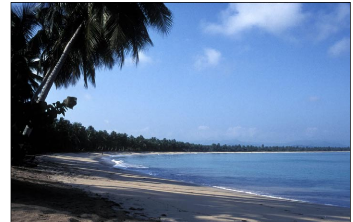
Pic. 6: The picture that nearly every visitor expects the whole Dominican Republic to look like

Currency: Dominican Peso (RD$). Gross national product (GNP): 13,5 billion Euro. Rate of growth of GNP: 8 % (2001 only 2,7 %). Rate of inflation: about 10 %. Gainful employment: service 62 %, industrie 23 %, agriculture 15 %. Agricultural products: sugarcane, bananas, coffee, cacao, tobacco, vegetables, rice, coconut. Raw materials: ferronickel, gold, silver, zinc. Industrie: production of nutrition, sugar, tobacco, iron, steel, cement. Tourism: 2,9 Mio. foreign guests (2001), 2 billion Euro income