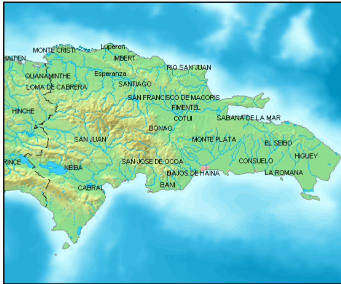
Pic. 1: Map of the Dominican Republic