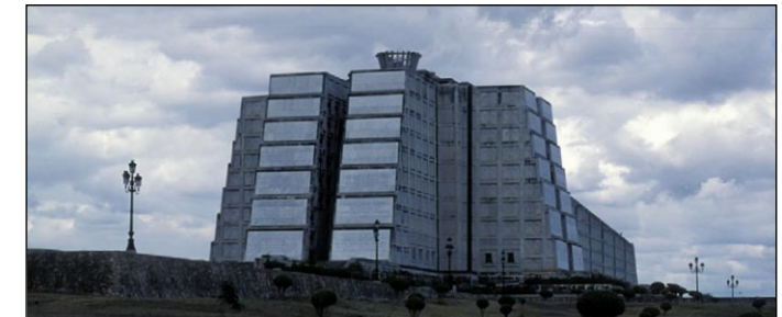
Pic. 4: Faro de Colón: 500 years discovery of the New World in 1992

In 1965 there broke out civil war and finally in 1966 the fourth republic was founded.