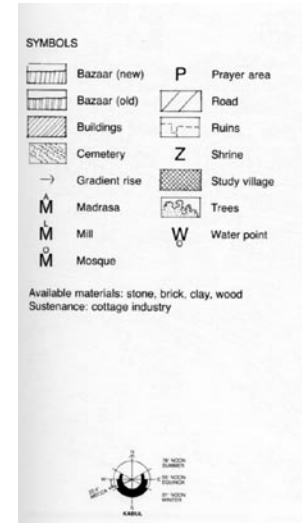
Pic. 3: legend 2

and woodworks. Istalif was as a preferred picnic-area for Kabul-inhabitants and became seat of a royal summer-house for Afghanistan's last king Zahir Shah. Istalif underwent a series of serious destructions. In 1842, the British army burned down the complete village, as a revenge before withdrawing from Afghanistan.