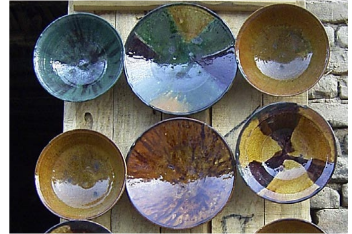
Pic. 9: Istalif pottery

Education: In the 70s there existed a highschool in Istalif. During the reconstruction after the victory over the taliban regime one boarding school has been rebuilt.