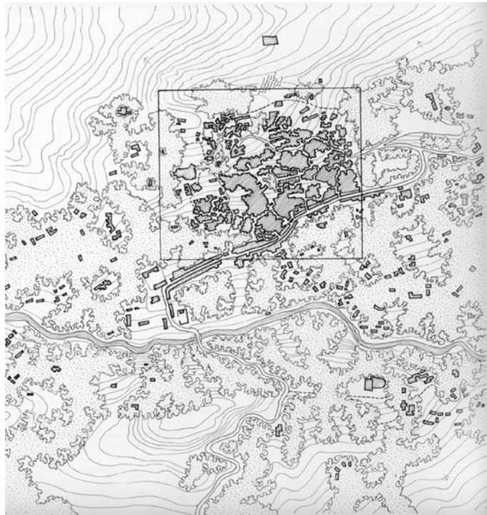
Pic. 1: map of Istalif (frame)