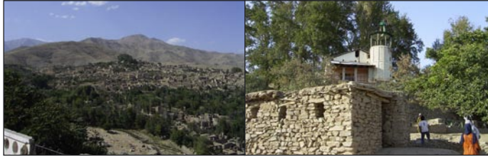
Pic. 5: view on Istalif