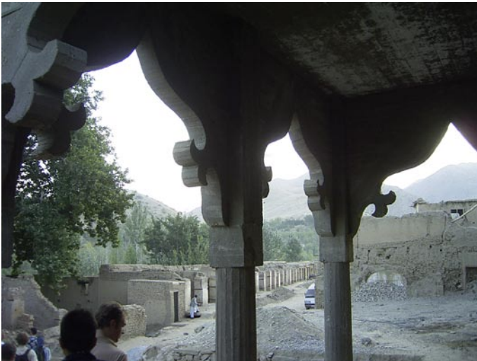
Pic. 10: reinforced concrete construction at the new-built mosque

The material used for building is mostly the regional available clay and earth as well as stones and some wood, mostly poplar, which is grown near the river that passes Istalif. There are some woods in the plain of Shomali, around Baghram. Since the construction of the paved road to Istalif more wood is used for constructions .