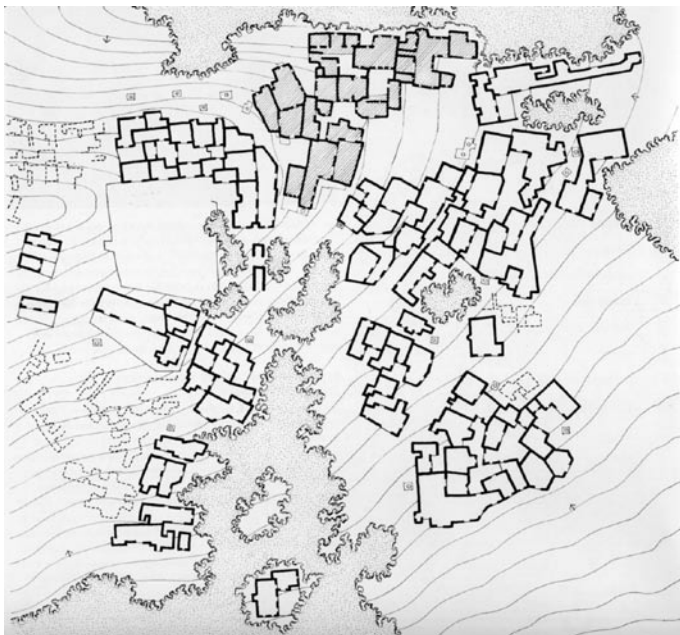
Pic. 7: the cluster-structure

Cluster: It is remarkable that by means of connecting walls,