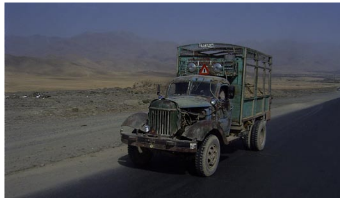
Pic. 8: truck on the main road from Kabul to Charikar in the shomali-plain

Since the mid of the 20th century there exists a paved road to Istalif, but inside the village most of the roads are of clay and gravel. A big problem are the mines and duds - remains of the many years of war. Though the main roads are claimed to be